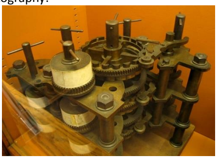
Figure 2. Parts of the original Babbage's machine.