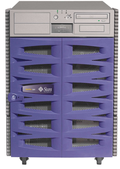
Sun Fire V880

8-way application and database server aggressively priced with PC servers