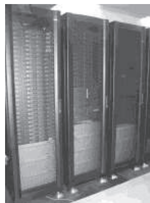
Cluster Computer for System Development

Our laboratory is pursuing research on next generation microprocessor architecture to meet such demands..