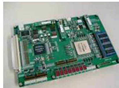
Ultra Dependable CPU Testbed

In addition, we also research on dependable operating systems and application programs. Dependable Computing is definitely the most important theme of IT for all people to enjoy the benefits of the information society.